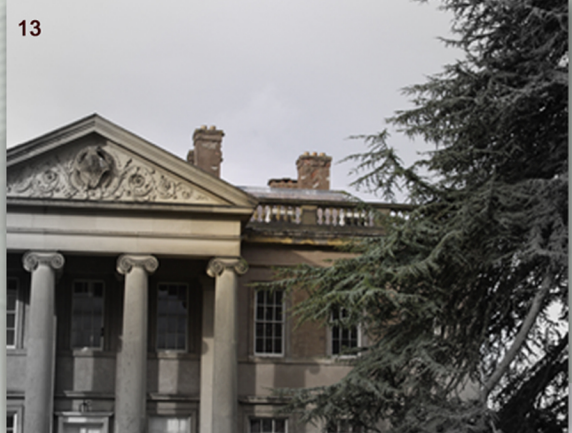
Brogyntyn Hall, Oswestry Designs to convert Grade II * Hall and estate buildings into bespoke accommodation, involving enabling development analysis.