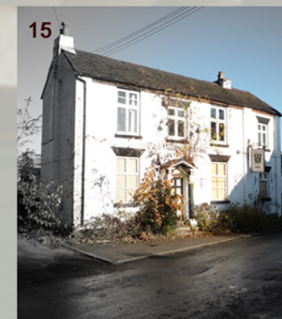
Conversion of Public House, Lapley Restoration and conversion of public house with new detached dwelling in existing car park