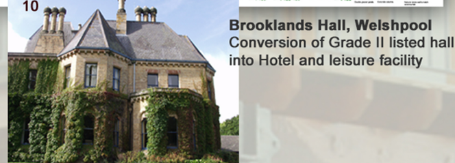
Brooklands Hall, Welshpool Conversion of Grade II listed hall into Hotel and leisure facility