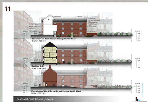
Conversion of former Malt house, Newtown Conversion of Malt house into 3 no. town houses and new town house to complete street frontage.

architects town planners building surveyors